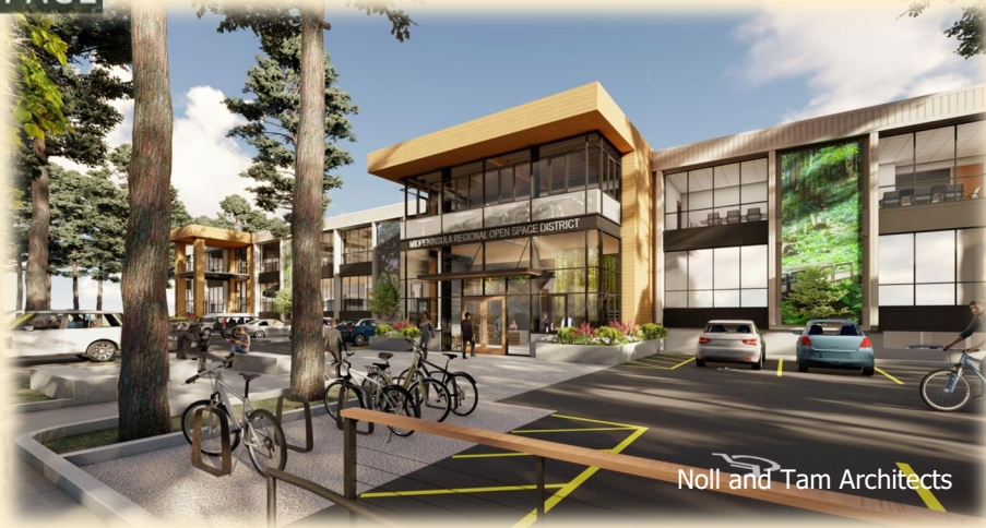
Noll and Tam Architects