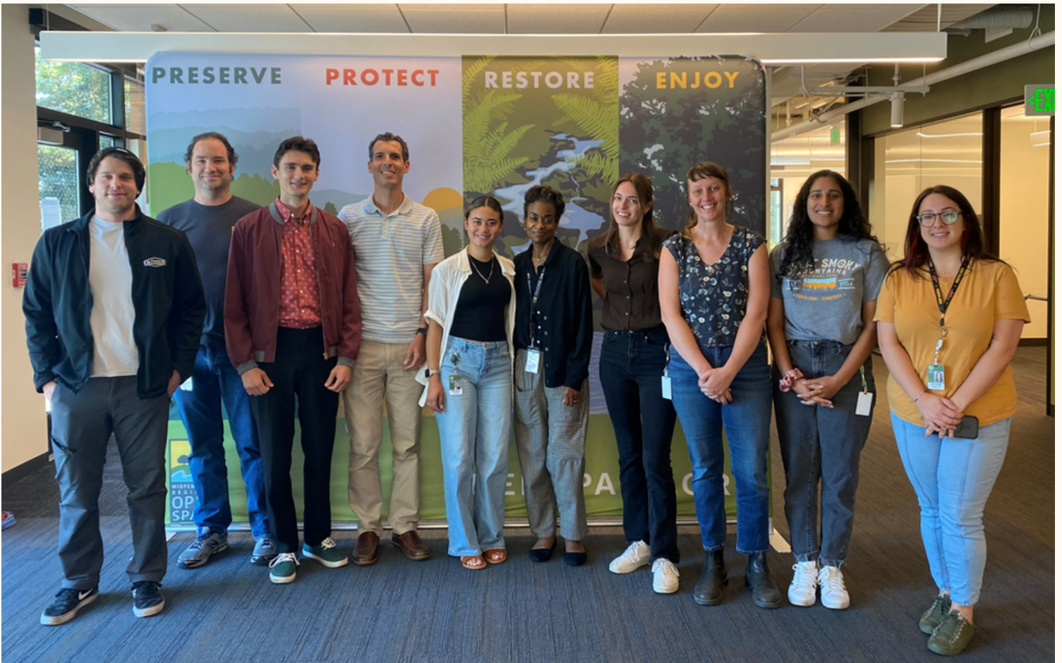
Interns and Supervisors at the 2023 Midpen Networking Event