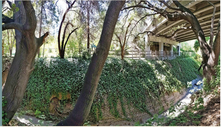
Stevens Creek Trail