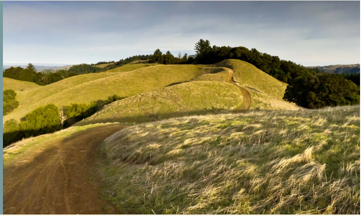
Long Ridge Open Space Preserve (Greg Lewis)